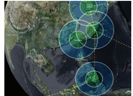
ASIA-PACIFIC REGION Comparable Mission Range at Sea Level, ISA